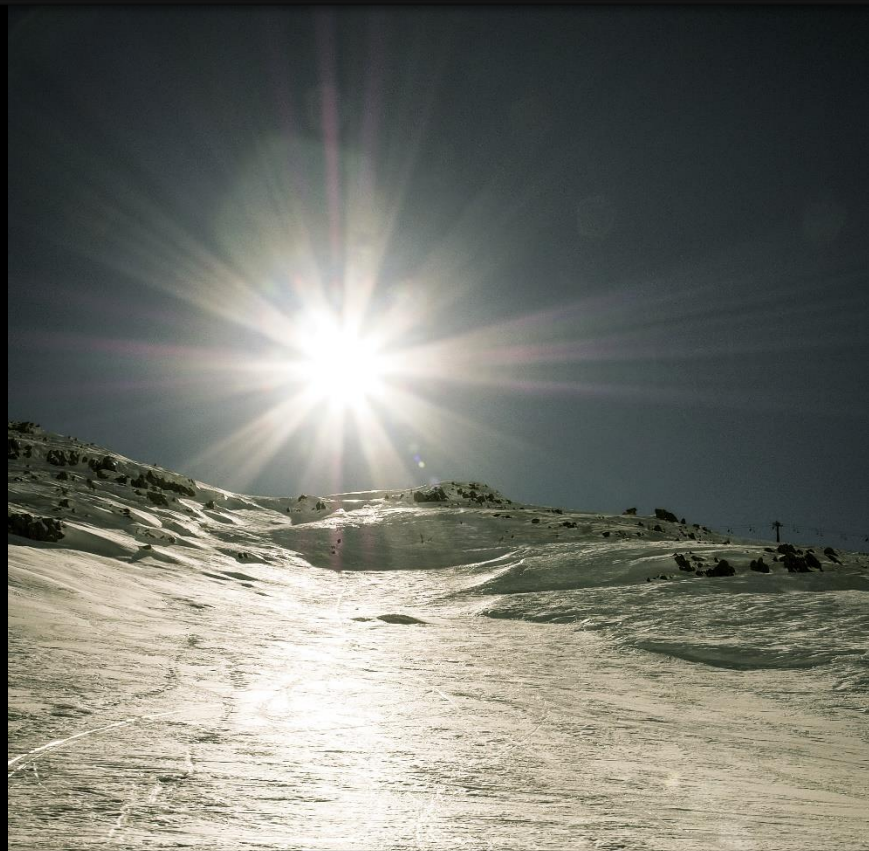
- MT. HERMON - HIGHEST POINT IN ISRAEL