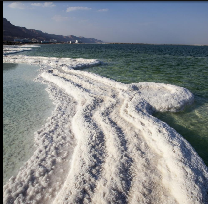
- DEAD SEA - LOWEST POINT ON EARTH